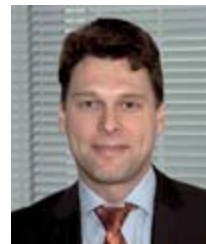
Author: Mirko Benz Product Management Competence Center Vision Technologies

in its GigE Power range. The versatile Trigger Device completes this range. Triggering via the network eliminates the need for the separate cables required until now. A true single-cable solution for the camera is now available in combination with Power over Ethernet (PoE). Aided by the integrated time- and path-based triggering delay, complex requirements can now be portrayed. Thanks to Track & Trace, a reliable assignment between image and belt-conveyed object is guaranteed throughout the entire processing sequence and the PC is relieved of time-critical tasks. The overall complexity of the system can thus be substantially reduced and its reliability can be increased.